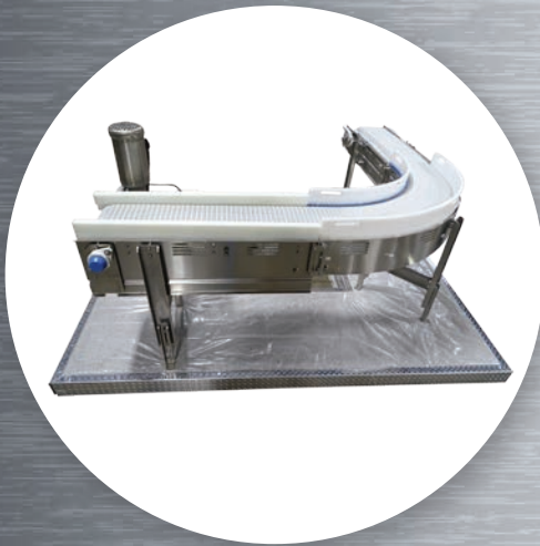
Sanitary MatTop Conveyor