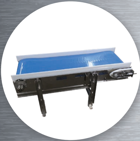
Sanitary Blue Belt Conveyor

Conveyors designed for easy cleaning and reassembly in sanitary and washdown environments