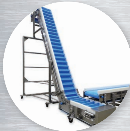
Sanitary Z Incline Conveyor