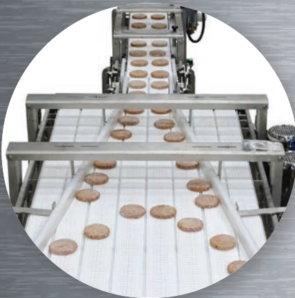
Sanitary MatTop Conveyor