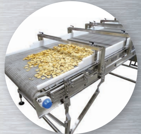
Sanitary Wire Mesh Conveyor